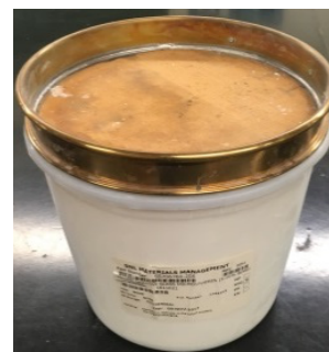
GMB Bucket and Sieve