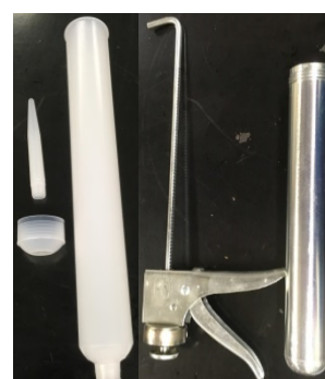
Semco tube, tip, plunger, and gun