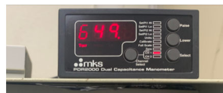
Pressure gage on top of vacuum chamber