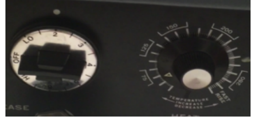
The vacuum oven heating knob is on the left.