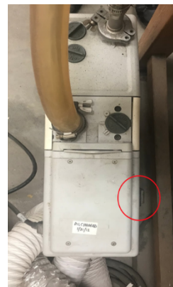
Vacuum Pump Switch